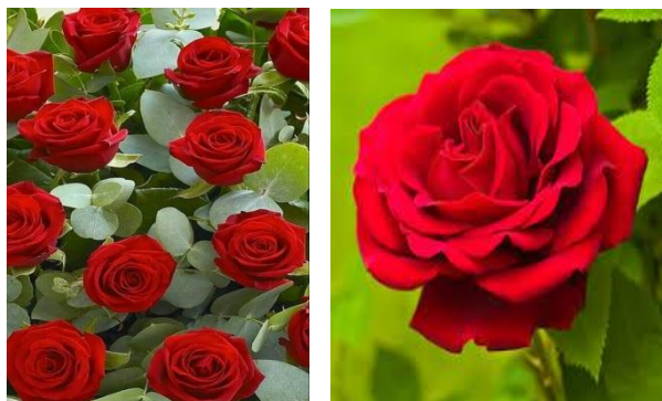
Figure 1. Flowers of Rosa centifolia